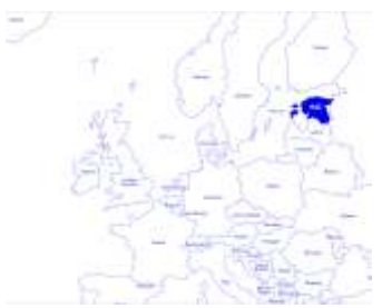
Promotional page about Estonia: <a href="https://www.estonia.ee">www.estonia.ee</a>.

Estonia is a small North European country and it has been a member of the European Union since 2004.